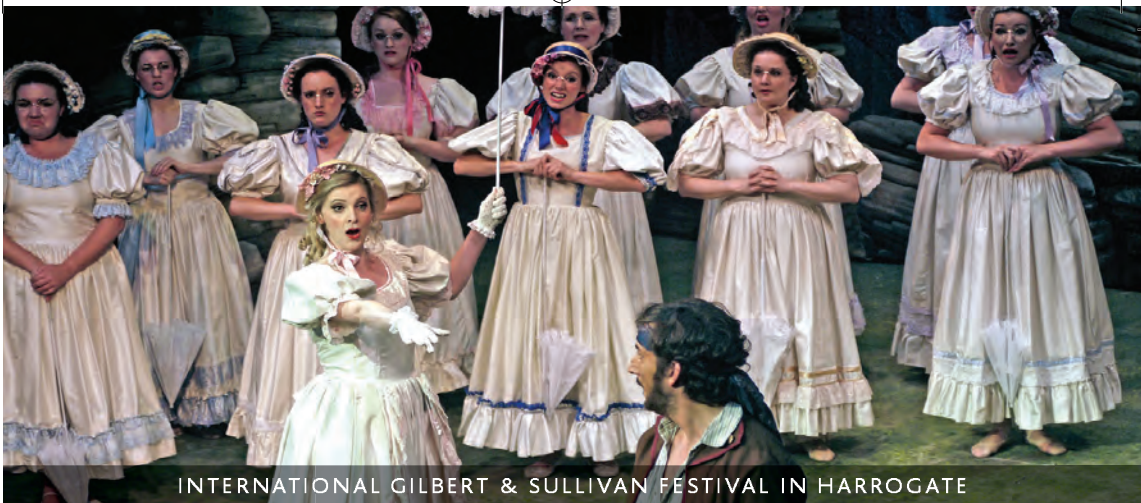
INTERNATIONAL GILBERT & SULLIVAN FESTIVAL IN HARROGATE