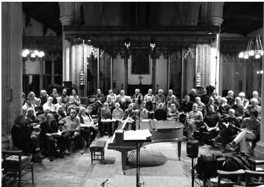
Photo taken during a break in the recording session at Orford Church on 1 December 2015.