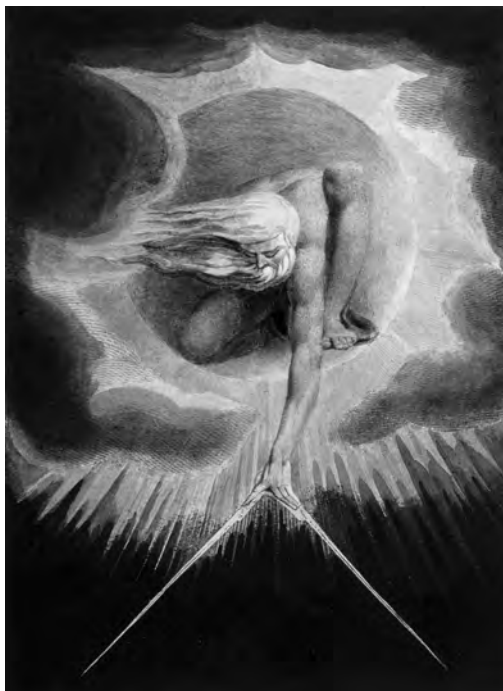
'Europe a Prophecy' by William Blake 1757-1827

The lists of performers were correct at the time of going to press.