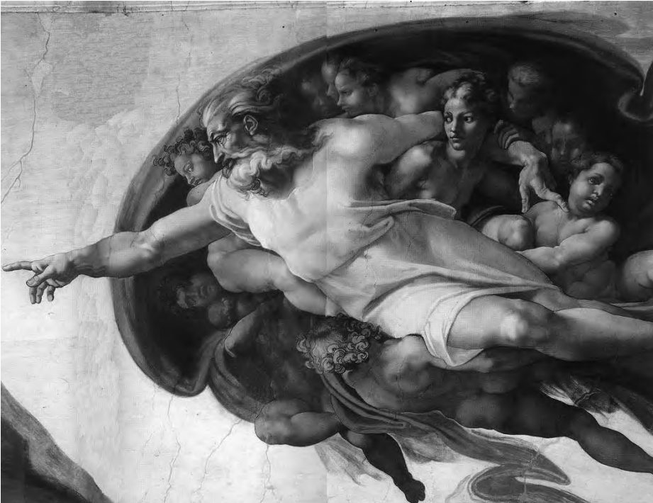
The Creation of Adam by God: Michelangelo (Sistine Chapel)

Sing the Lord, ye voices all! Utter thanks, all ye his works. Celebrate his power and glory. Let his name resound on high! The Lord is great; his praise shall last for aye. Amen.