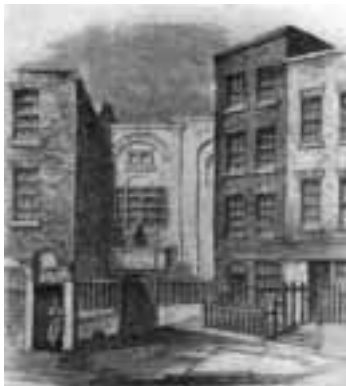
Musick Hall in Fishacre Street, Dublin.