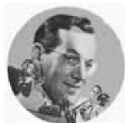
Get 'In The Mood' at Snape Proms