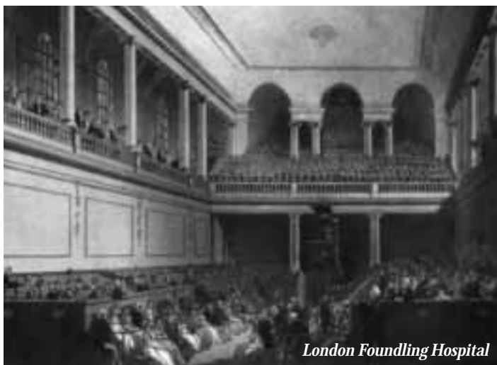
London Foundling Hospital

Future engagements include Messiah for the Orchestra of the Age of Enlightenment and also the CBSO in Symphony Hall Birmingham, St Matthew Passion for Sir John Eliot Gardiner and the English Baroque Soloists on tour around Europe and the UK.