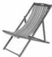
Relax with Suffolk Cottage Holidays!

There's an endless list of great things to do in Suffolk. But you need an ideal base to get the most from your visit.