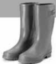
The Literary Arena at Latitude Festival