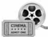
A film at Aldeburgh Cinema