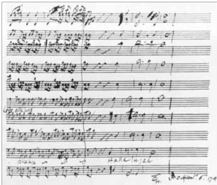
Handel's score for the Hallelujah chorus 1741.